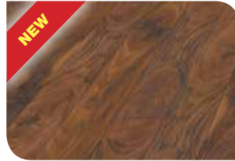
Westford Acacia KPLA10010L