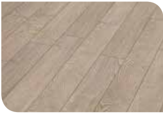
Providence Oak KPLA10004L