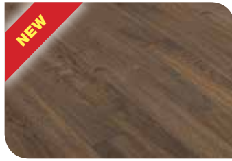
Manchester Oak KPLA10009L