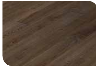
Martinez Oak KPLA10003L