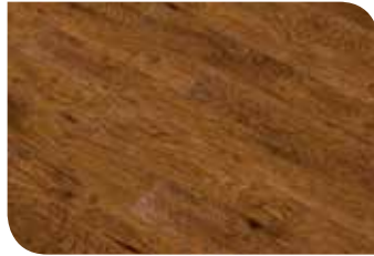
Brockton Hickory KPLA10002L