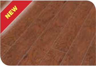
Cranston Hickory KPLA10008L