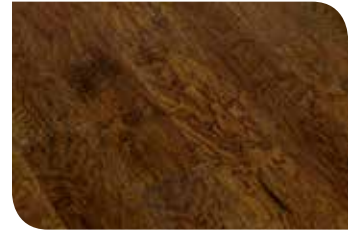
Charleston Hickory KPLA10001L